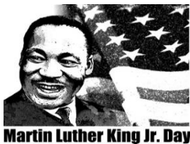
Martin Luther King Jr. Day

18 Cheese Pizza or Stromboli HS -Breadstick w/ Stromboli Crunchy Broccoli Salad Italian Veggies Frozen Fruit Juice & Tidbits Milk